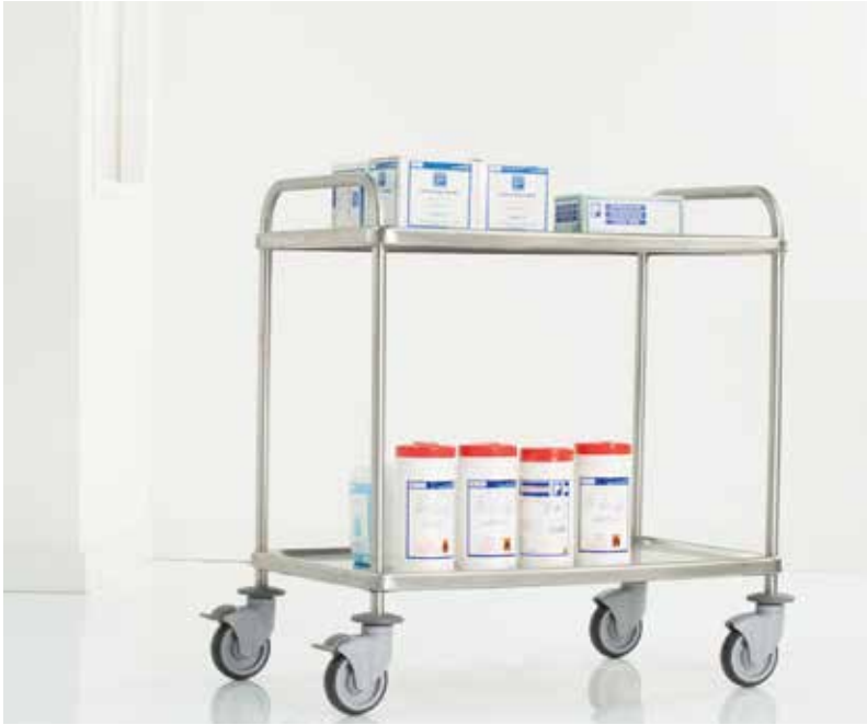
Light duty general purpose trolley