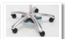
Weighted base pole