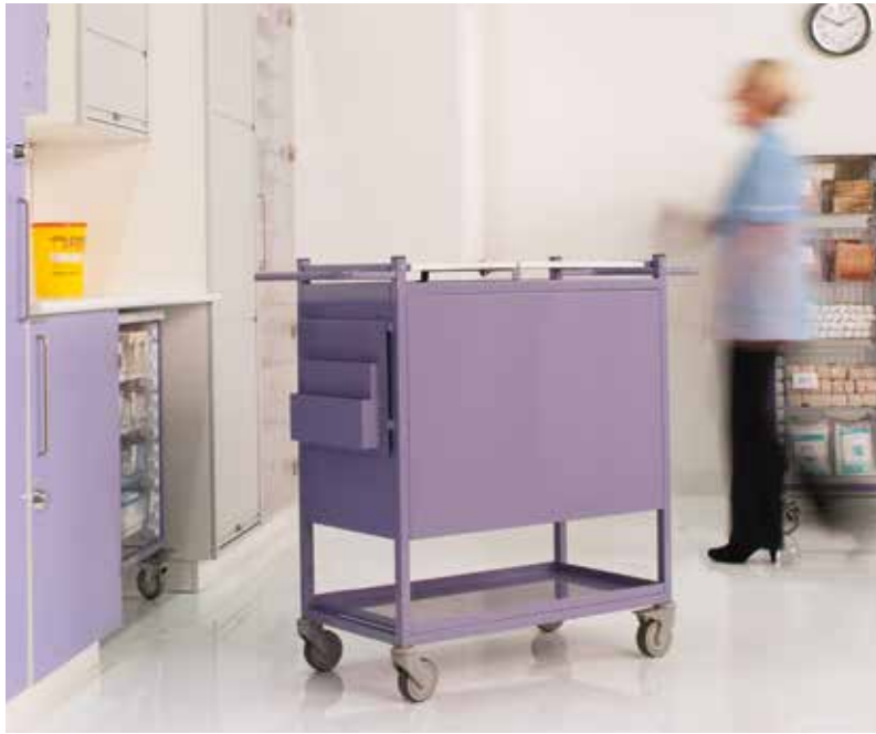
Lilac case notes trolley with file holder