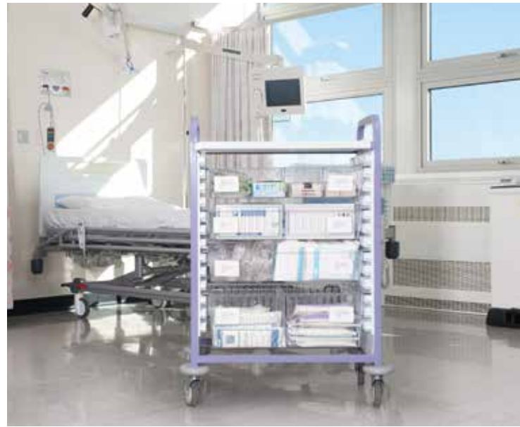
Lilac frame colour is available from stock for fast track delivery