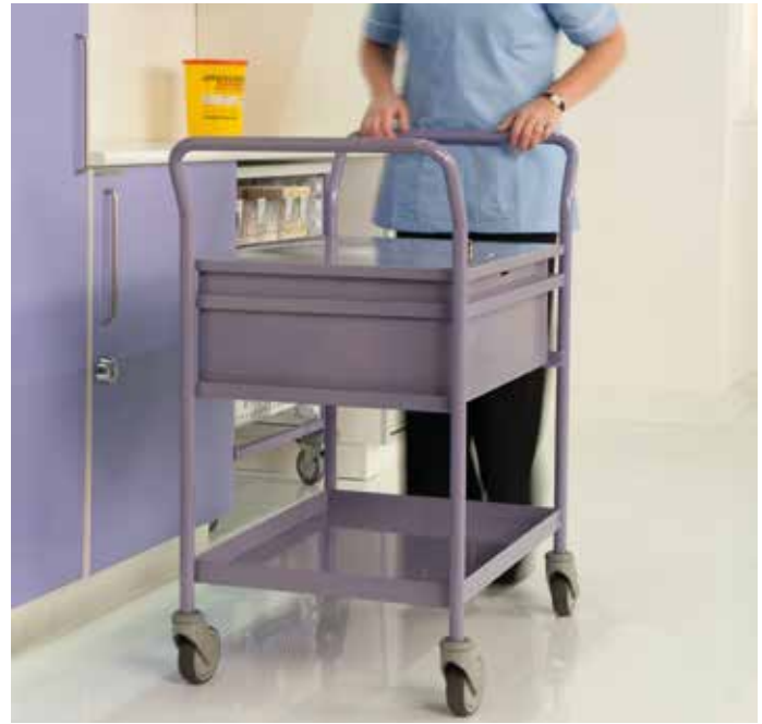
Medical records transfer trolley