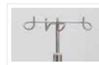
Four hook design