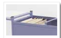
Rails fitted for filing pockets