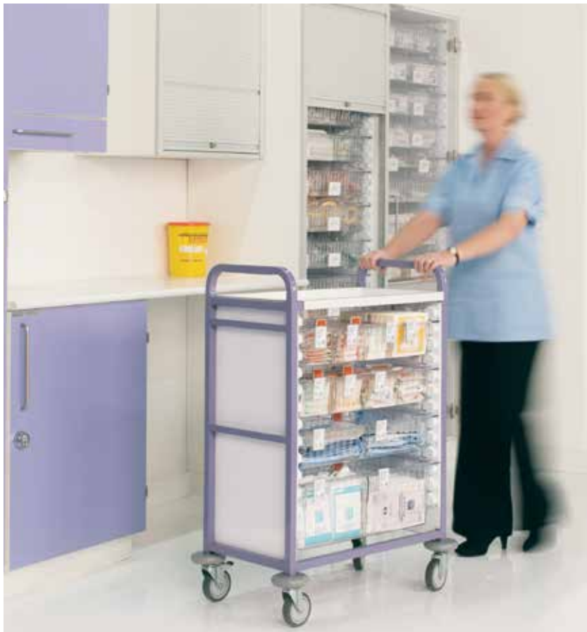
Fixed rails on both side provide balanced handling