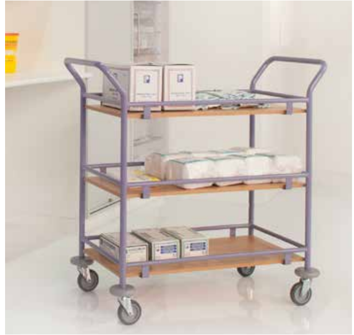
General purpose MS3104 in lilac