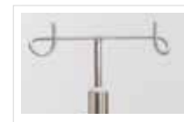
Two hook design