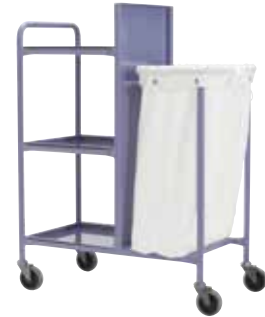
MS3208 trolley shown with linen bag