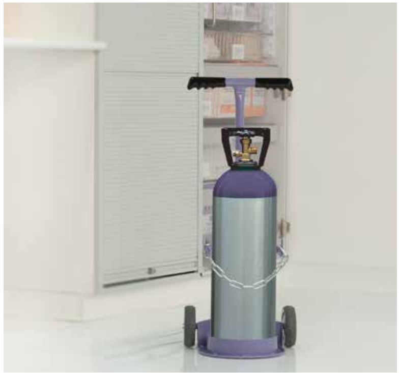
Lilac cylinder trolleys are available via fast track delivery