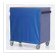
Protective front cover