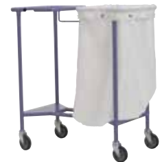
MS3202PC shown with linen bag