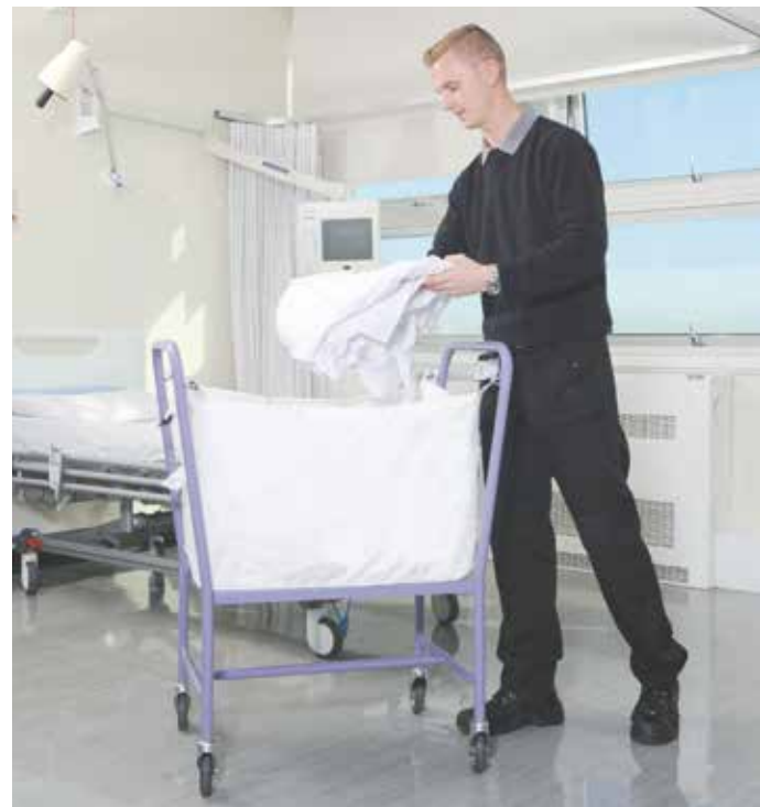
MS3205 is fitted with 4 x 100mm castors