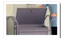
Secure locking for privacy