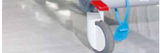
Ideal for everyday use on busy hospital wards