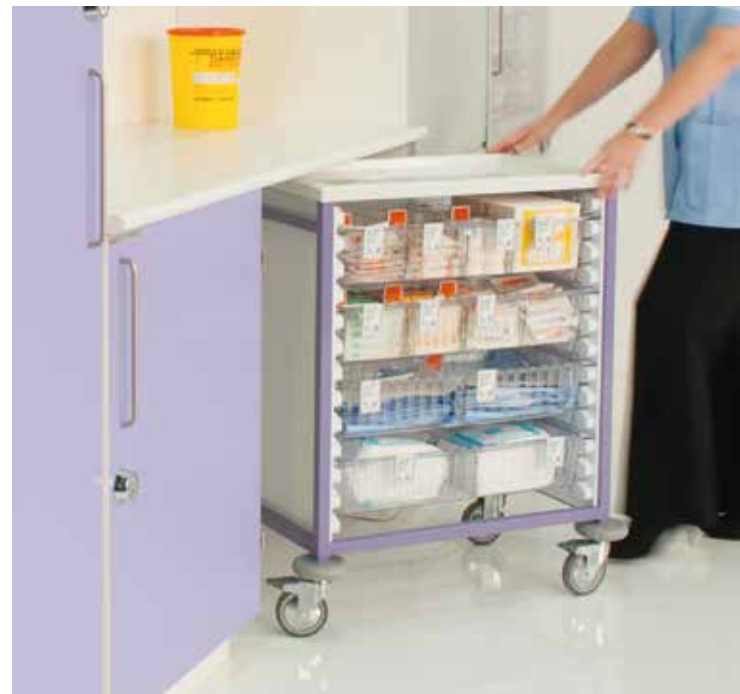
Designed to store under workbench surfaces