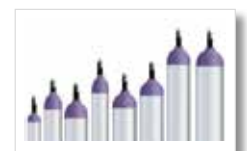
Fits variety of sizes