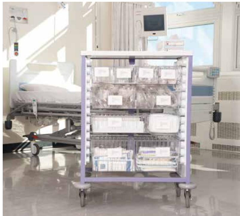
Lilac frame colour is available from stock for fast track delivery