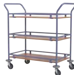
MS3104 shown with optional buffers