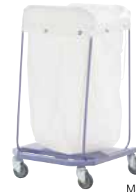
MS3206 shown with linen bag