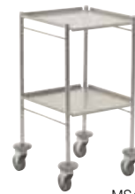
MS4401B shown with buffers