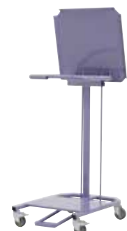
MS3200 shown with and without bag