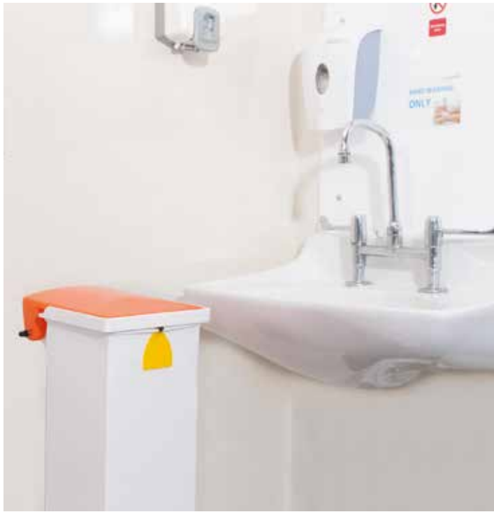
For use with wet-rooms and cleaning areas